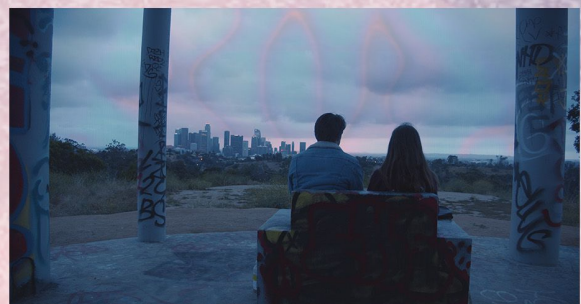
Another still from the film shows the LA skyline under an electric feedback sky